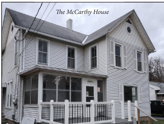
The McCarthy House